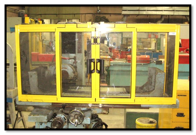
Fig.1 - Typical installation

This product has been made to our highest quality standards. Features include a sturdy aluminum frame, with impact resistant polycarbonate screens. This safety guard has been built for industrial usage using high quality material for years of service.