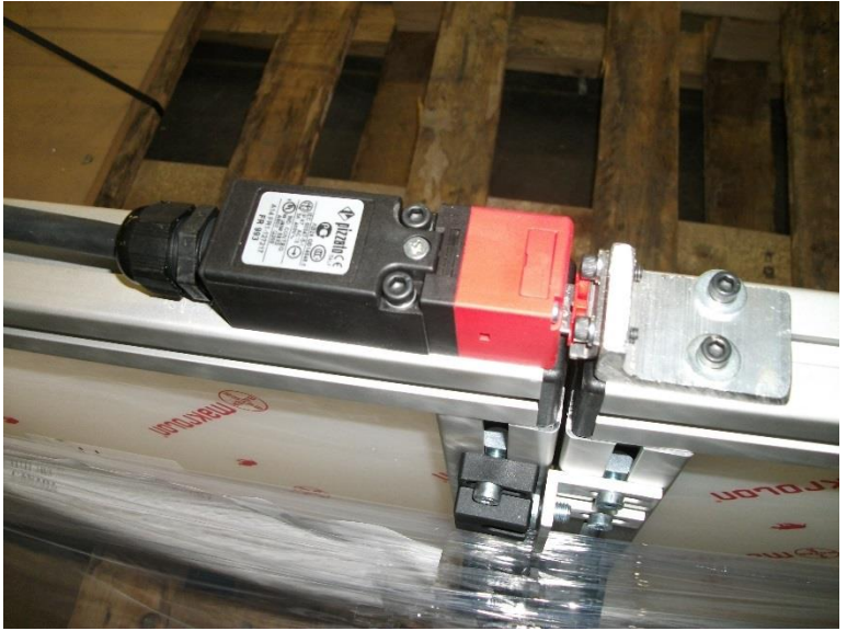
Fig.4 (May differ from actual product)

Operational characteristics: 3A @ 240VAC, 0.1A @ 240VDC Mechanical durability: 100000 operating cycles Ambient air temperature: -25 to +70 °C